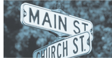
The connection between Wall Street and Main Street.